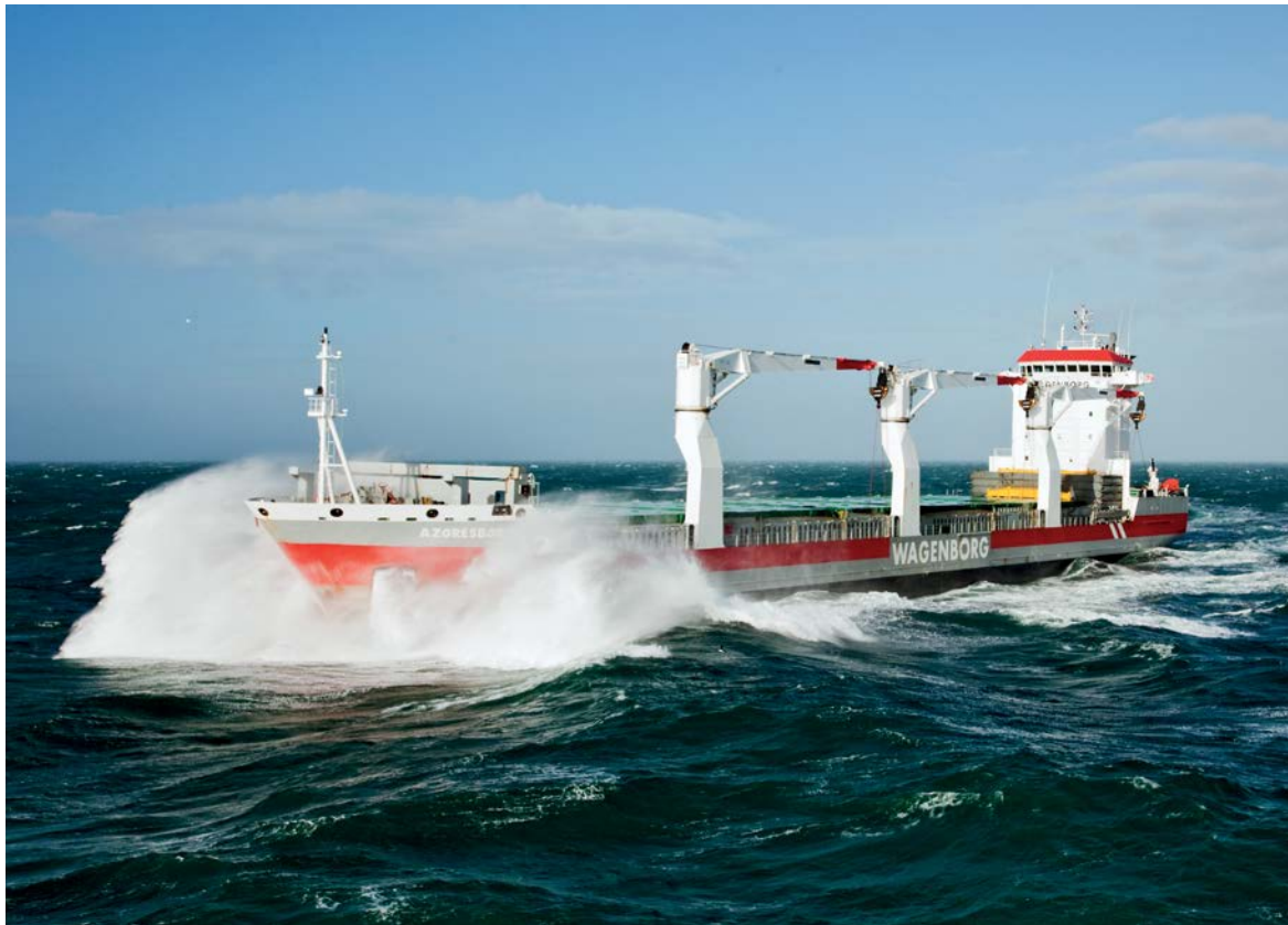
Figure 1: mv Azoresborg.

The Dutch Safety Board's investigation revealed that the crew and the local stevedores responded immediately and managed to pull the chief mate out of the water. Nonetheless, the chief mate died.