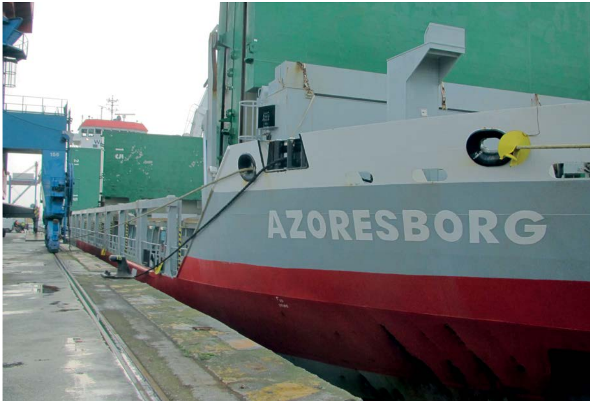
Figure 8: mv Azoresborg moored in Bilbao on 1 March, two days after the accident, showing a gap between the quay and the vessel (seen from the forward part of the forward hold).