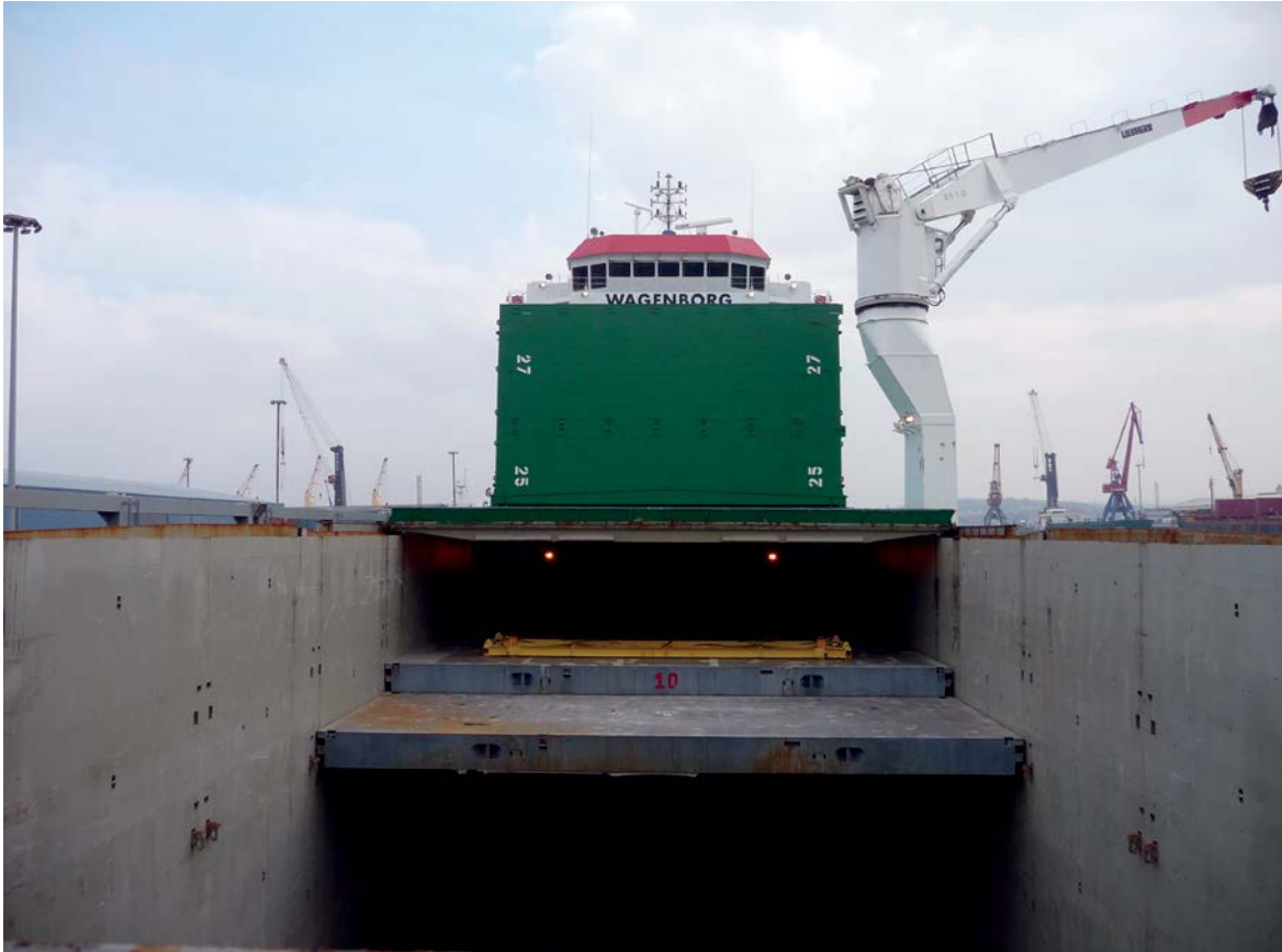
Figure 2: A tweendeck on board the Azoresborg (hold 2).

Four support consoles support each pontoon. The consoles each weigh around 45 kg and have to be manually installed by the crew. After the tweendeck has been installed, it is secured by a locking pin (see figure 3).