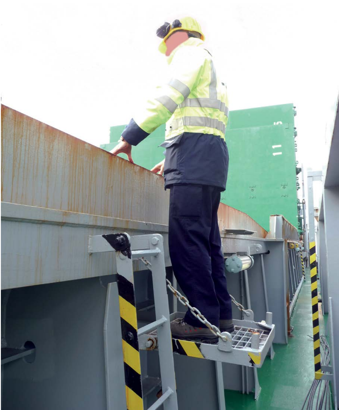
Figure 5: Reconstruction of the position on the stevedore platform. No fall protection had been installed. The platform is located on the aft side of the forward hold.

The Azoresborg uses what is known as stevedore platforms to supervise loading and unloading operations from the side opposite to where the ship is being loaded or unloaded (see figure 5). The crew can reach the fold-out platform with a fixed ladder. The platforms contain supports on which detachable fall protection can be installed. None of the platforms had (recently) been equipped with fall protection. This is evident from the fact that none of the platforms, particularly the supports, showed any paint damage. This type of damage inevitably occurs when installing fall protection.