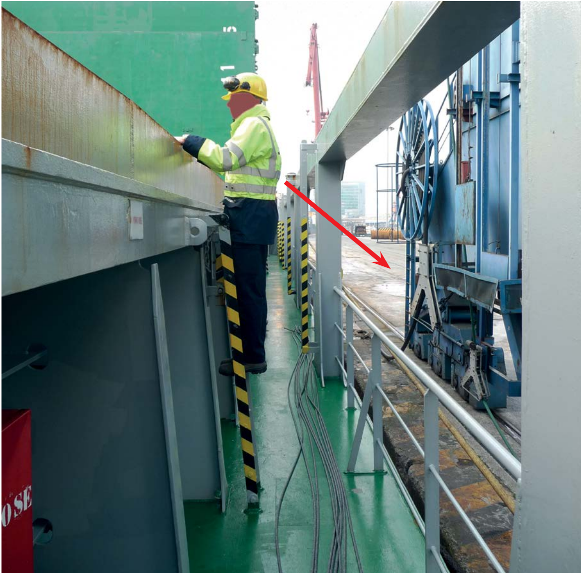
Figure 7: Reconstruction of the chief officer's position and fall.

When the chief mate was last seen, he was standing on a ladder at a height of about 80 centimetres. It follows from the witness statement and the autopsy report that the chief mate fell over the railing onto the quay and then ended up between the quay and the vessel. The proximity of the hoisted pontoon and his unstable position on the ladder meant that it was all the more relevant to have effective fall protection in place. However, there was no fall protection. Because the chief mate was standing on a ladder, the height of the railing proved to be insufficient.