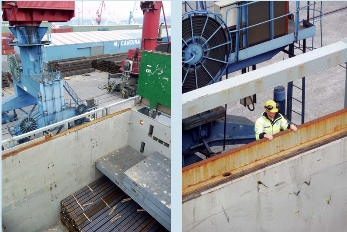
Figure 6: Simulated position of the chief mate on the ladder near the hatch coaming. The person in the photograph is around the same height as the fatally injured chief mate.

The tweendeck was hoisted out of the hold at 07.52 hour. When the pontoon was positioned above the hatch coaming, the chief mate instructed the crane driver to swing the pontoon to the left and then slowly lower it. Shortly thereafter the seaman near the gangway noticed that someone located amidships had fallen overboard. It later emerged that the person was the chief mate. The seaman grabbed a life buoy, went ashore and ran over the quay to the position where he presumed that the chief mate had fallen into the water.