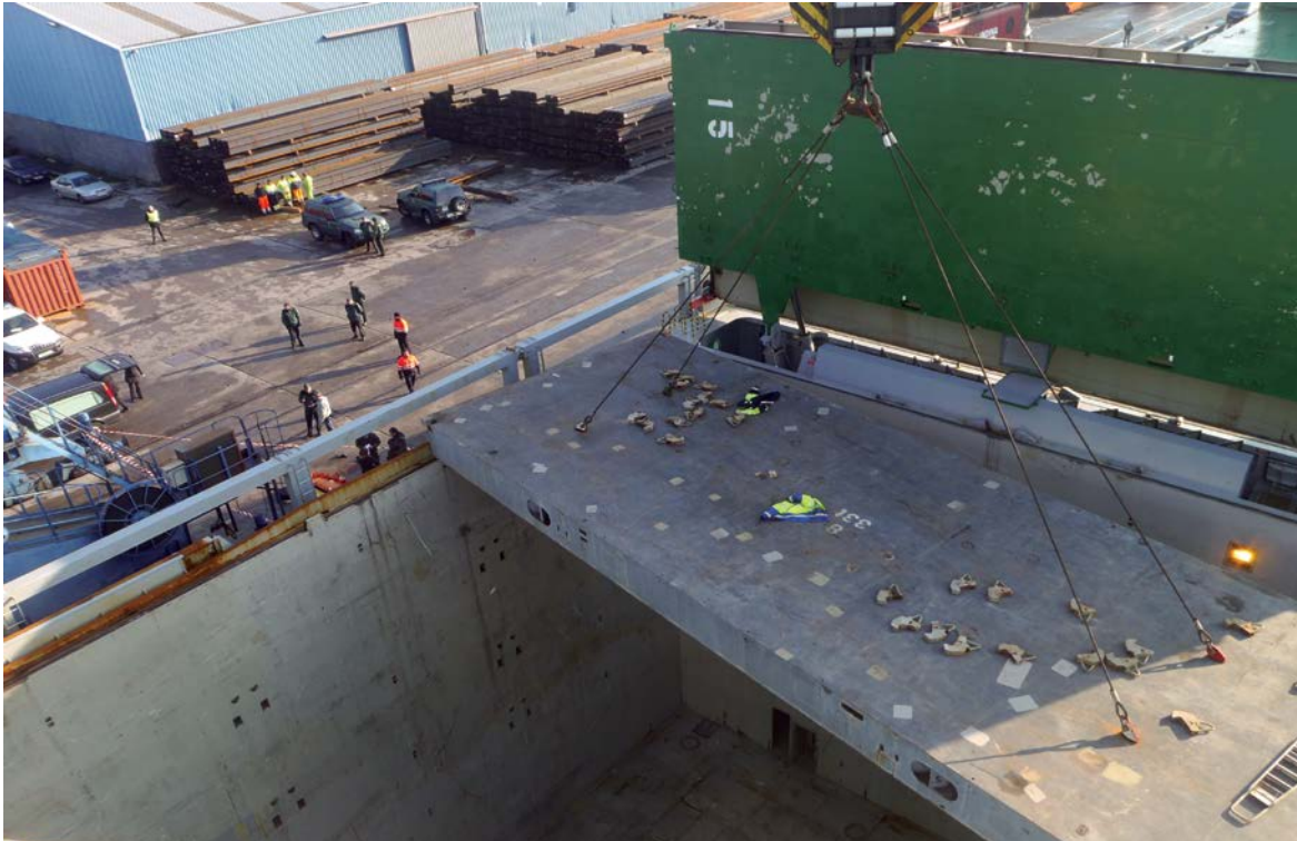
Figure 4: The pontoon used as a work platform.

Consoles are usually installed on board the Azoresborg and its sister vessels using a pontoon as a work platform. After placing the consoles that are to be installed on the pontoon, the crew then position themselves between the four hoisting cables, to which they secure themselves with a safety harness (see figure 4).