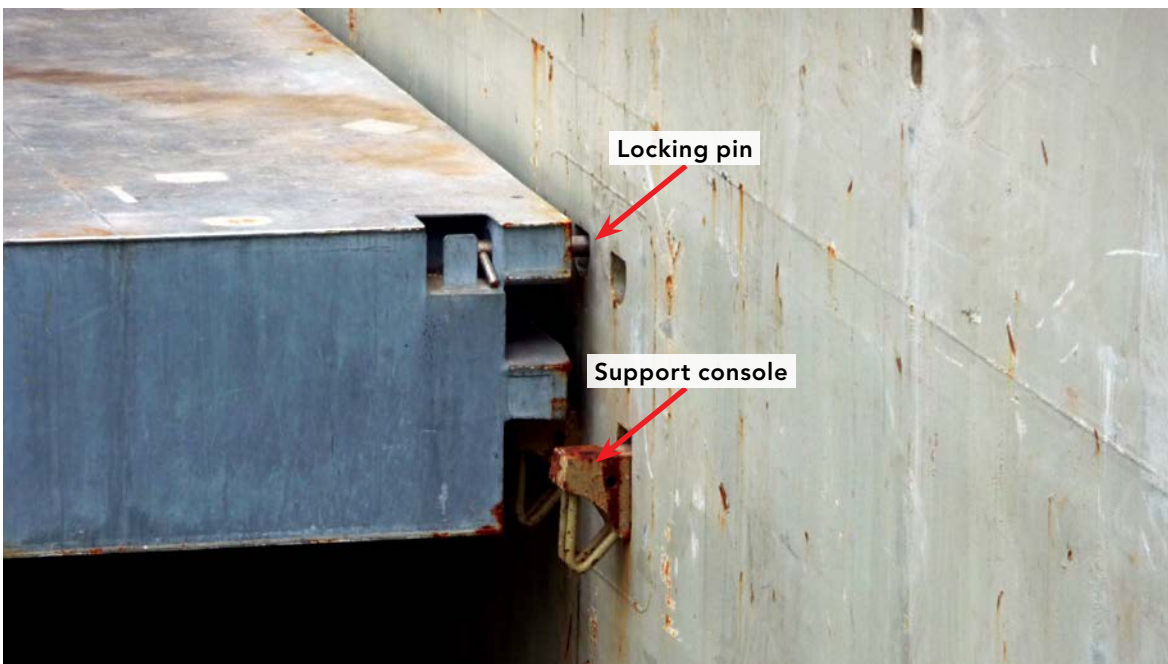
Figure 3: Consoles in cargo hold.

Four support consoles support each pontoon. The consoles each weigh around 45 kg and have to be manually installed by the crew. After the tweendeck has been installed, it is secured by a locking pin (see figure 3).